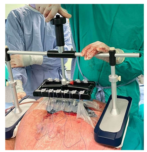
Figure 3: Installation of Fasciotens© Abdomen

dosage of diuretics was decreased the following day.