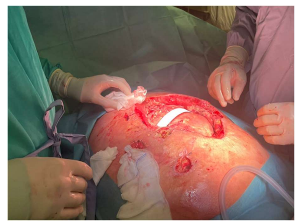
Figure 2: Fascial gap of 15 cm before Fasciotens© Abdomen installation

On the twenty-fifth postoperative day, with low inflammatory parameters values and no signs of peritonitis, we decided to install the Fasciotens© Abdomen system in combination with the ABThera™ system for primary closure of the abdominal wall fascia (Figure 2).